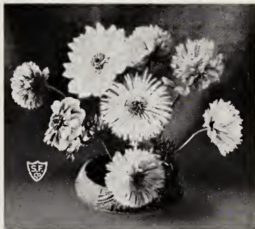
ST. BRIGID ANEMONES

LILIUM ELEGANS —This is also of low growing type with large cup-shaped upright flowers in richest orange to crimson shades; also yellow forms. Fine as clusters between low growing shrubs. Early summer flowering. Bulbs three for 75c.